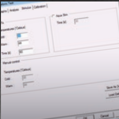
Can be operated from the Interacoustics VNG software VN415 / VO425 v. 7.06 or later