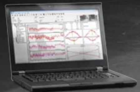
Caloric test with the Interacoustics VNG software