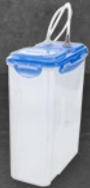
Included external water tank